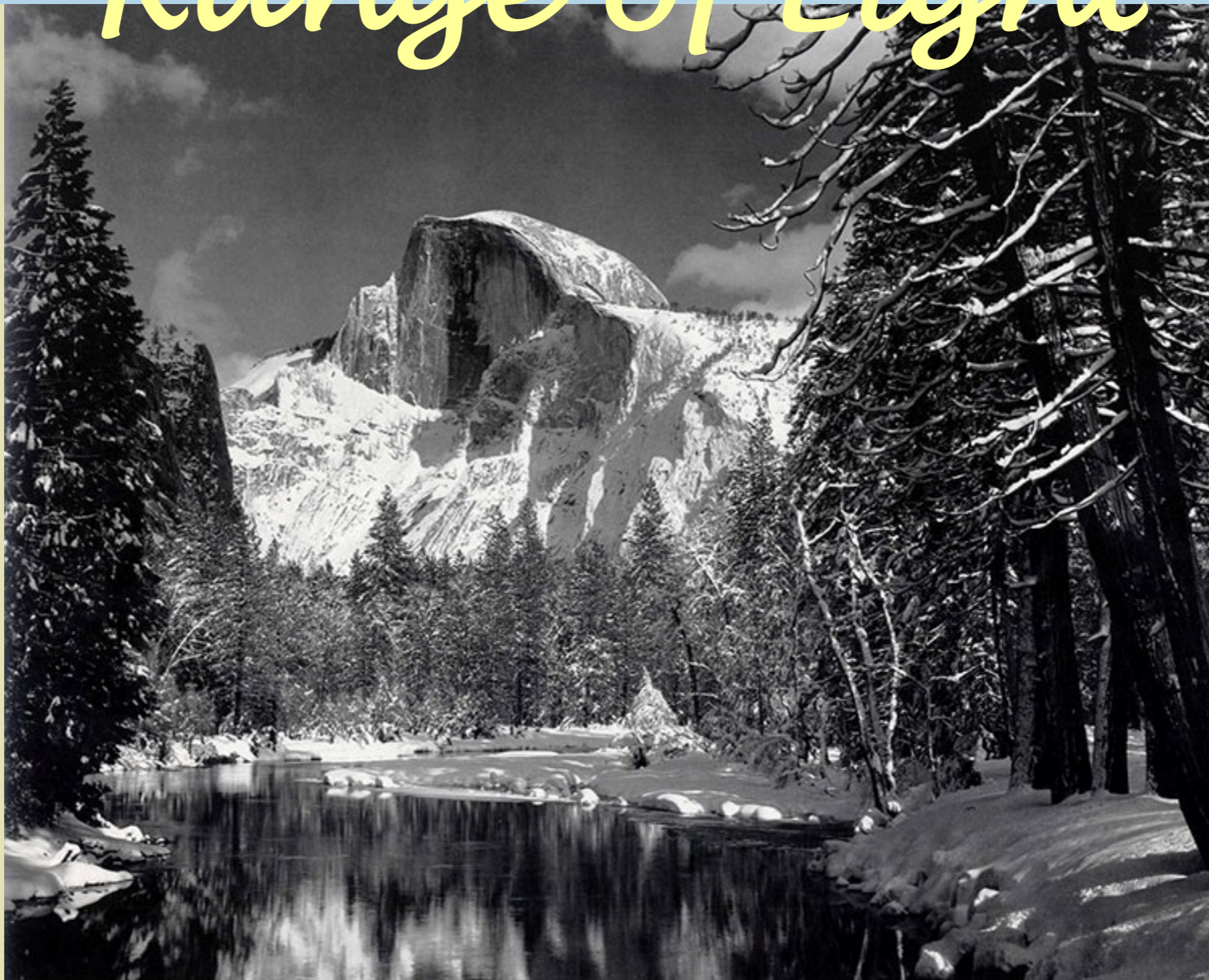
Photo credit: Ansel Adams: Half Dome, Merced River, Winter, Yosemite Valley, c. 1918